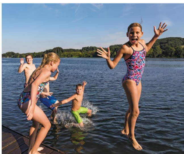
“Swimming in the Ruhr”, Seaside Beach Baldeney

Green education starts with the youngest in Essen. The Schule Natur (Nature School) in the local recreation area Grugapark offers experience-based courses for schools. The University of Duisburg-Essen also conducts green research: The Faculty of Engineering, for example, is developing processes for using algae to remove residual pharmaceuticals in wastewater treatment plants.