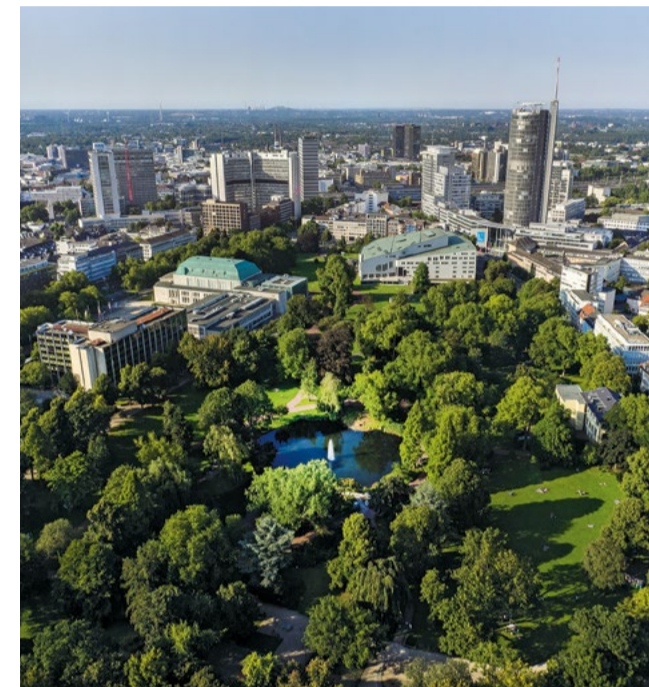
City Park, Essen-Südviertel

Ruhr Metropolis, Zollverein UNESCO World Heritage Site and European Capital of Culture RUHR.2010 – Essen is all of this. And this year, Essen is the European Green Capital. The successful history of its transformation to the greenest city in North Rhine-Westphalia provides a role model of structural change for many cities in Europe. Essen has transformed from the pre-industrial convent with its abbess gardens and emperor parks to a pulsating coal and steel town to today's metropolis with a green heart. Throughout this process, Essen has been and is being carried into its green future by good ideas, sustainable urban planning, and the commitment of citizens, modern companies, and innovative institutions. Examples include the Garden Town Margarethenhöhe, built at the start of the 20th century, and the recent programme “ESSEN.New ways to the water”. Essen as a green city can be discovered in countless places and through many different ideas. Therefore our claim is: Green up your life!