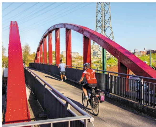
Cycle Superhighway Ruhr – RS1